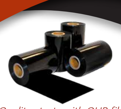
Quality starts with OUR film