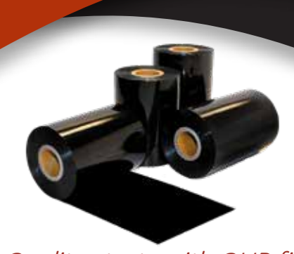
Quality starts with OUR film