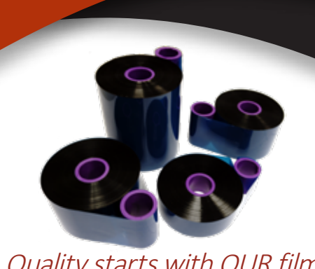
Quality starts with OUR film

High speed, near edge wax/resin is used for imprinting date, price, lot and bar codes directly onto flexible packaging. This Premium wax resin formulation is coated on a 4.0 micron PET- carrier film designed for use on TTO in-line/near edge printers at speeds up to 40 ips. This thinner film technology offers improved productivity through longer length ribbons and reduced printer downtime related to ribbon changeovers. ZZ14 provides excellent print darkness and is compatible with a wide range of film materials, as well as offering excellent scratch and smear resistance. Low transfer energy properties combined with our anti-static back coat allow the user to extend the life of the printhead and reduce maintenance costs.