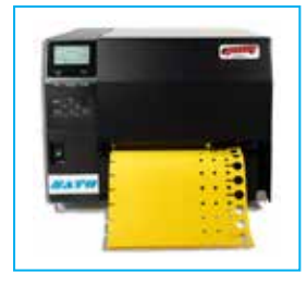
BEST VALUE in the NEAR-EDGE CATEGORY