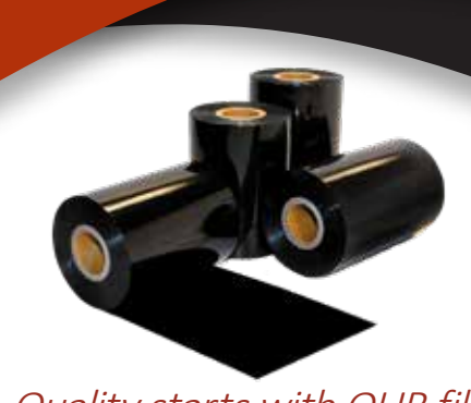
Quality starts with OUR film